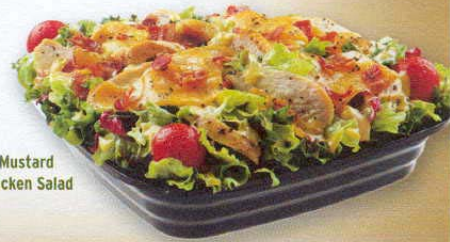
Honey Mustard Chicken Salad