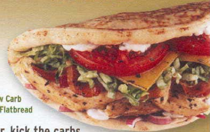
Mesquite Chicken Low Carb Toasty™ Flatbread