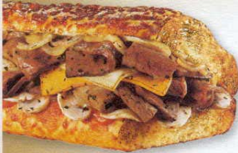
Black Angus Steak

Every Quiznos sub is made with the finest quality ingredients and is flawlessly designed to not only add extraordinary flavor to the sandwich, but to make the perfect recipe for toasting. Your Quiznos sub is toasted so all the flavors of the ingredients - from the premium meats to the real cheeses - burst through in every toasty bite.